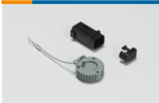
Automotive Connector Caps & Covers (98)